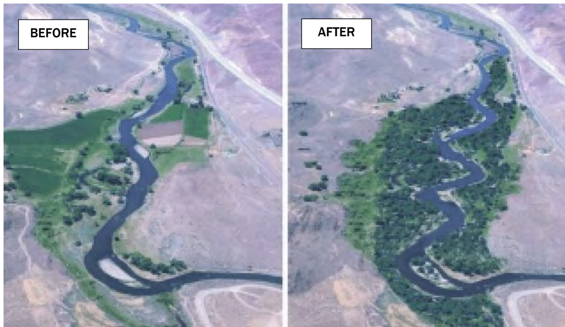
Before & after ecosystem restoration.